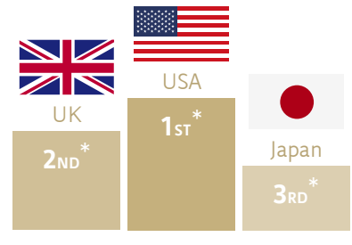
*market by value and by volume