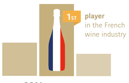
23% of the sector's exports (by value)